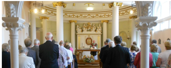
Mass in The Bar Convent Chapel York