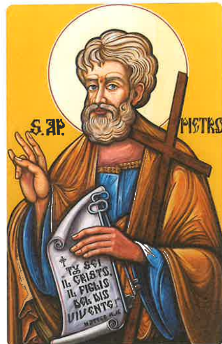
Image: The icon of Saint Peter (Simon) in the Church of Saints Gervasius and Protasius in Pavia, Italy

Frank G. Slaughter, Upon This Rock: a novel of Simon Peter